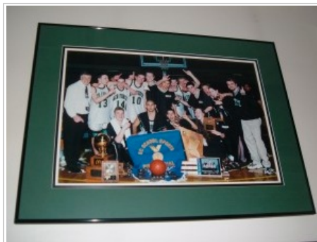
Pitt Meadows championship team 2000